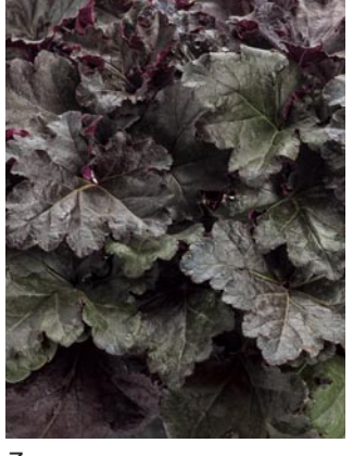
3 PRIMO<sup>®</sup> 'Black Pearl' Heuchera