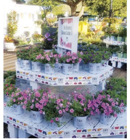
Kerbv's Nurserv -

Kerby's Nursery is a great example of how a fresh coat of paint can have a great impact on existing tables or benches. Many of the tables in this garden center are fun shades of yellow and green, but the white structures in the Proven Winners Destination area really made the display stand out.