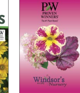
24" x 36" Banner -Windsor's Nursery