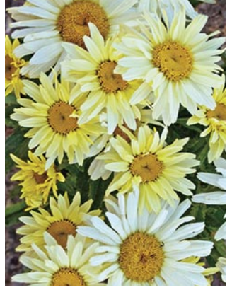
1 AMAZING DAISIES<sup>®</sup> 'Banana Cream' Leucanthemum