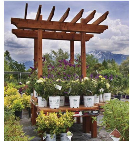
Glover's Nursery -Glover's Nursery added two pergola structures flanking a main walkway to create visual impact. These structures are deep in the store and help to draw customers back to see the displays.

Kerby's Nursery is a great example of how a fresh coat of paint can have a great impact on existing tables or benches. Many of the tables in this garden center are fun shades of yellow and green, but the white structures in the Proven Winners Destination area really made the display stand out.