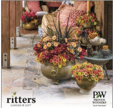
23" x 23" Lifestyle Poster -Ritter's Garden & Gift