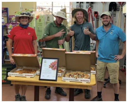
Green Thumb Nursery – Tampa, FL