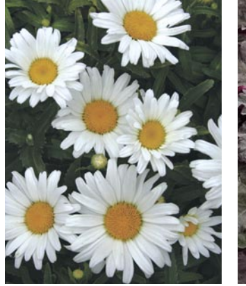
2 AMAZING DAISIES® DAISY MAY® Leucanthemum