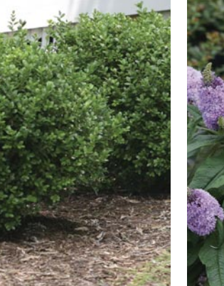
1 LOW SCAPE MOUND<sup>®</sup> Aronia melanocarpa 2 SPRINTER<sup>®</sup> Buxus microphyllla