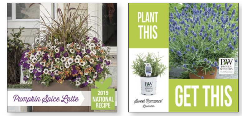
Readymade social media graphics like these are available to all CONNECT+ subscribers.

Using your scheduling tool, it's helpful to create a number of posts ahead of time and schedule them to post automatically during your busiest times or over the weekend. You will still need to monitor the comments daily, but you'll save time and it will be less stressful than having to create content on the fly.