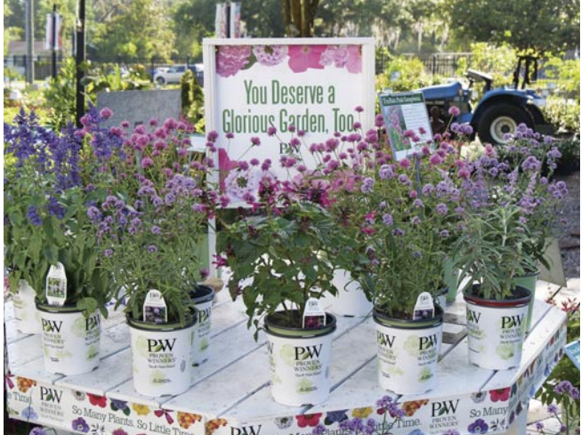
Offering regionally appropriate plants from the Proven Winners line is key to Kerby Nursery's success.

Working with one of our great wholesale grower partners, Flora Express, Kerby's Nursery decided to create a Proven Winners Destination at their retail garden center in Seffner, Florida. They chose to position it in a spot that was near the center of their store but was not visible from the entrance. Custom signage and special white tables with benchtape drew customers back into the space for a closer look. Merchandising Proven Winners annuals, shrubs and a few perennials together there created an attractive, welcoming area that shoppers were drawn to.