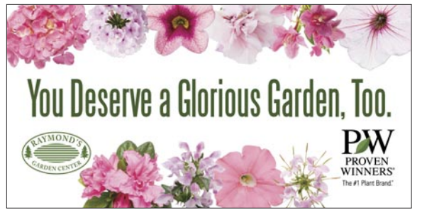
5' x 2.5' Banner – Raymond's Garden Center