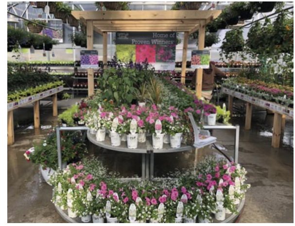
New custom built pergolas are the highlight of the new outdoor Proven Winners Destination, showcasing premium perennials and shrubs.