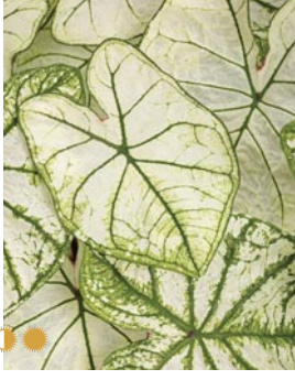
HEART TO HEART™ 'Snow Drift' Caladium hortulanum USPP27072