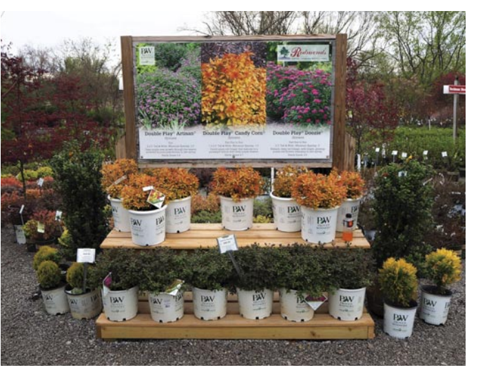
Redmond's Garden, Landscape & Gift Center -This simple display featuring custom signage allows Redmond's to feature three key shrubs and clearly lists the attributes of each variety.

The staff at Apenberry's does a great job creating attractive, inviting displays in their smaller store footprint. Using a gorgeous stone table to showcase their Proven Winners plants adds a touch of class.