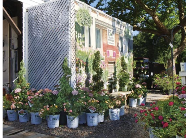
Merchandising the space with custom signage and benching set it apart in the garden center and drew customers in for a closer look.