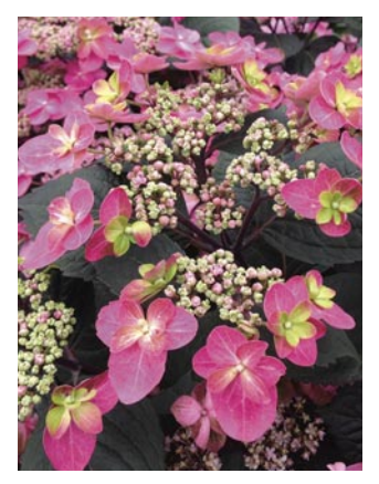
8 TUFF STUFF<sup>™</sup> Hydrangea serrata