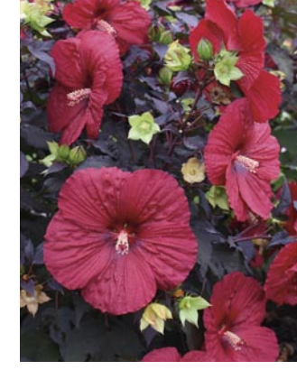
12 SUMMERIFIC® 'Holy Grail' Hibiscus