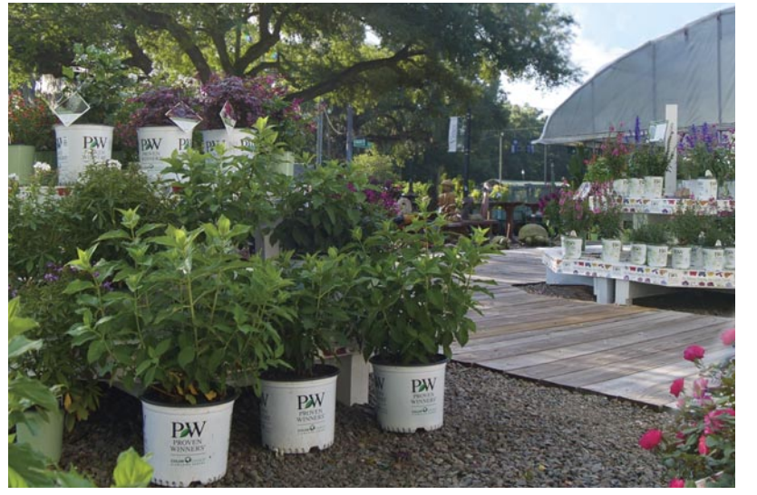
Restocking regularly with fresh product from wholesale grower partner Flora Express kept shoppers coming back for more.