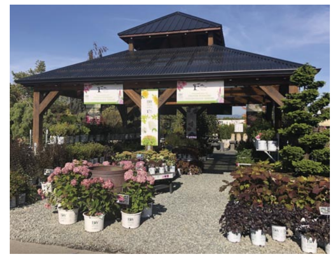
Cedar Rim Nursery -This large barnlike structure really draws in the customers at Cedar Rim and provides cover during brief rain showers. Annuals, perennials and shrubs are incorporated into unique and engaging displays.

Efforts your team makes in constructing structures and endcaps will not go unnoticed by your customers. They elevate the professionalism of your business and project a confidence to your customer base that says you're serious about serving them. Use these merchandising techniques to draw people over to key areas, promote weekly sales, display fresh product, showcase items needed for a simple project, or any other creative ideas your staff dreams up.