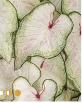
HEART TO HEART 'White Wonder'