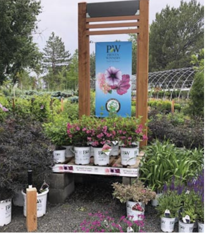
Wood's Nursery & Garden Center -The staff at Wood's Nursery used a simple sign and structure to create an instant endcap in the shrub and perennial department. The best part is that the base of this structure is just cinder blocks and a pallet!