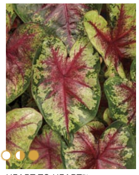
HEART TO HEART™ 'Flatter Me' Caladium hortulanum USPP27946