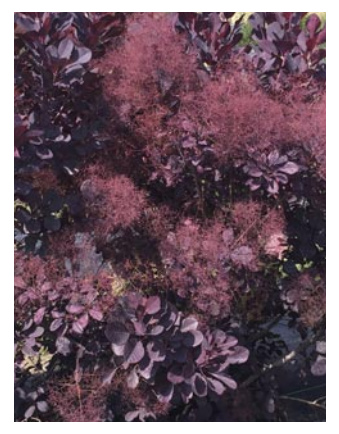
4 WINECRAFT BLACK<sup>®</sup> Cotinus coggygria