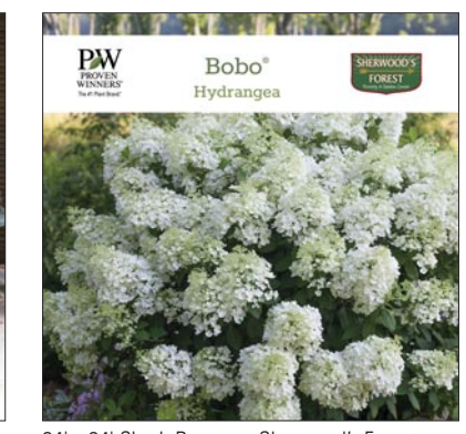
24' x 24' Shrub Banner – Sherwood's Forest