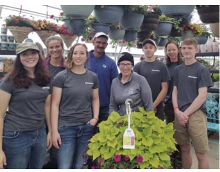
Dakota Greens – Custer, SD

"The knowledge we gleaned from this course was invaluable as we found ourselves using it daily in our conversations with our customers while promoting the benefits of planting Proven Winners products. Thank you for the knowledge and the pizza!" Mother Nature Garden Home & Pet Powell River BC