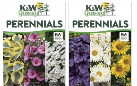
24' x 34' Banners - K&W Greenery

8' x 4' Garden Solutions Banner – Wood's Nursery