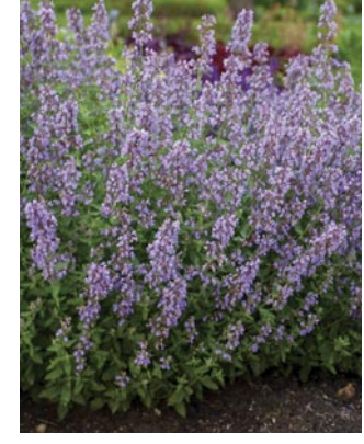
4 'Cat's Meow' Nepeta