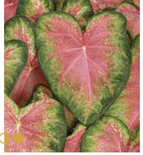
HEART TO HEART™ 'Rose Glow' Caladium hortulanum USPP20070