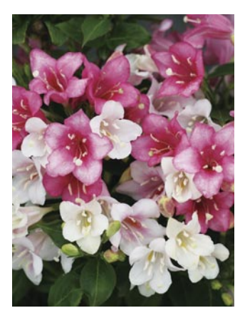
12 CZECHMARK TRILOGY® Weigela florida