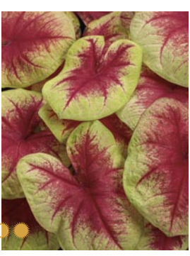
HEART TO HEART™ 'Lemon Blush' Caladium hortulanum USPP25450