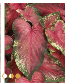
HEART TO HEART™ 'Heart's Delight' Caladium hortulanum USPP23992