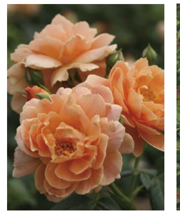
9 AT LAST® Rosa

6 INVINCIBELLE LIMETTA® Hydrangea arborescens