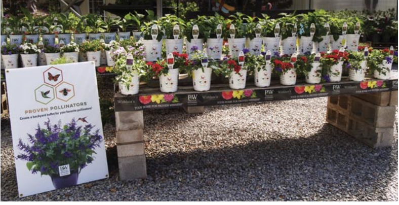
Windsor's Nursery, Kimberly, ID -

Tagawa Gardens, Centennial, CO -This destination garden center chose two prominent tables to make a Proven Pollinators display. Hanging informative signage over the display paired with benchcards, benchtape and round stake tags created an eye-catching display that customers were drawn to.